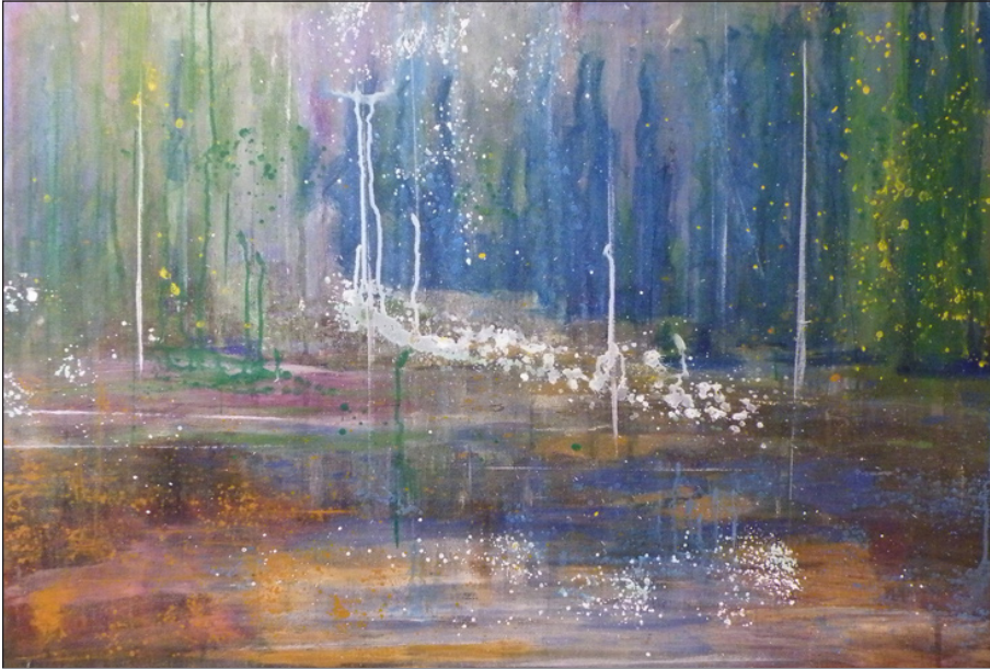
Plein Abstract —Acrylic by Pamela Clark.