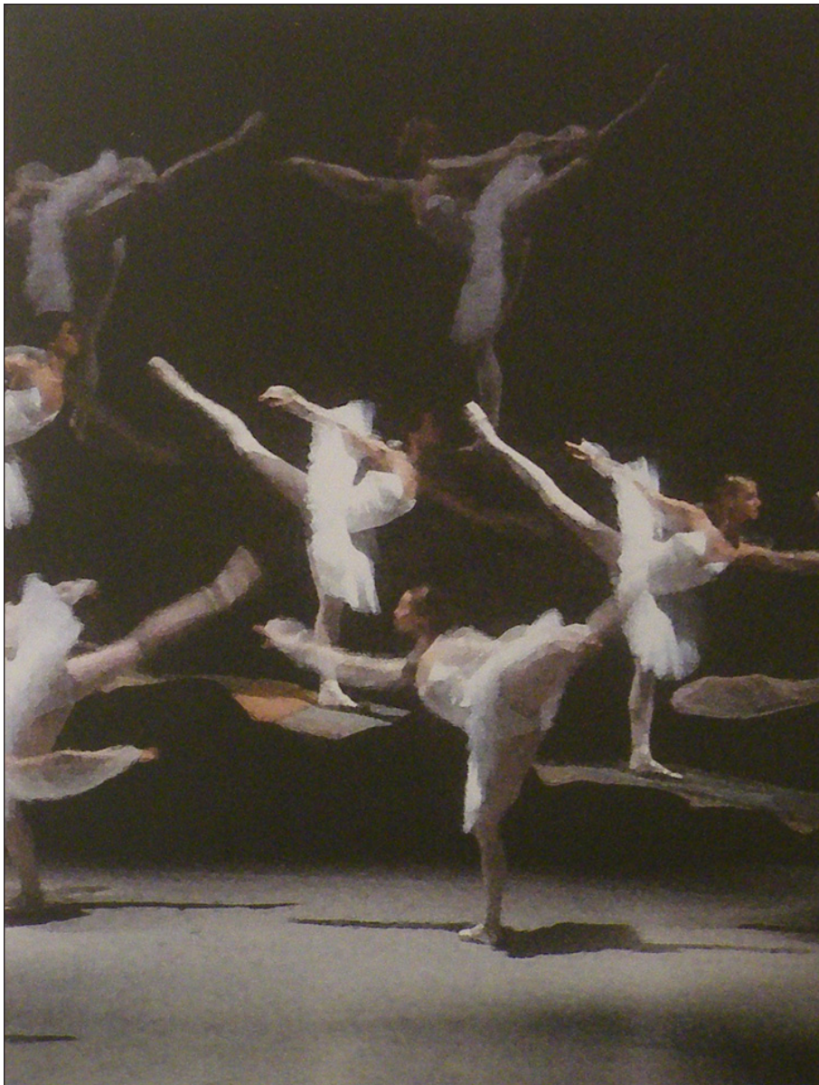
Dove Flight