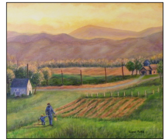
Coming Home —Oil on Canvas by Copper Mable