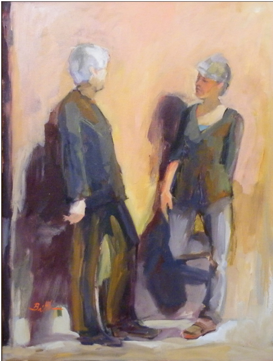
The Conversation —Oil on canvas by Nancy Brittle.